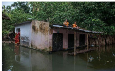
Heavy floods in 2015 resulted in families being trapped at Satkhira, Bangladesh.

This photo essay consists of the effect of climate change in South Asian countries over the past eight years.